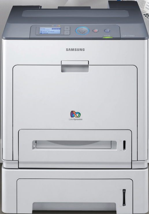
Samsung Colour Laser Printer CLP-775ND